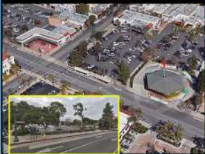
SANTA BARBARA TRANSIT CENTER