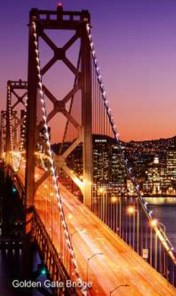
Golden Gate Bridge