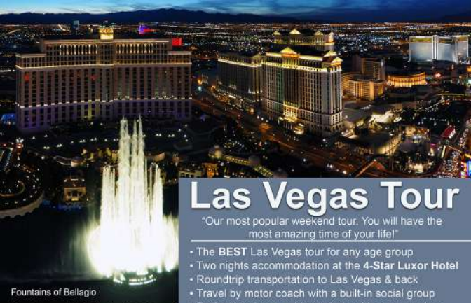
Fountains of Bellagio